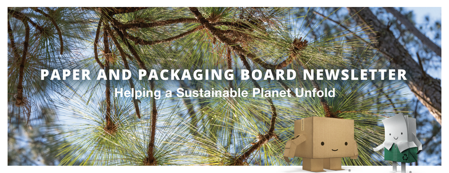
IN THIS ISSUE: Campaign Highlights | Sustainable Thoughts | Industry News | Innovations | Data Trends That Matter | Social Spotlight