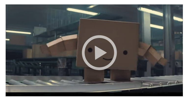
WATCH on Youtube.com/howlifeunfoldsppb

"Since I've been spending some more time at home recently I was able to catch this awesome commercial by Paper and Packaging Board. Boxes are cool!"