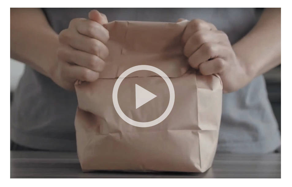
"Companies are starting to pay more attention to sensory marketing, but it's still new."

CHECK OUT the full-length video at Youtube.com/howlifeunfoldsppb and read an article on sensory marketing at HowLifeUnfolds.com.