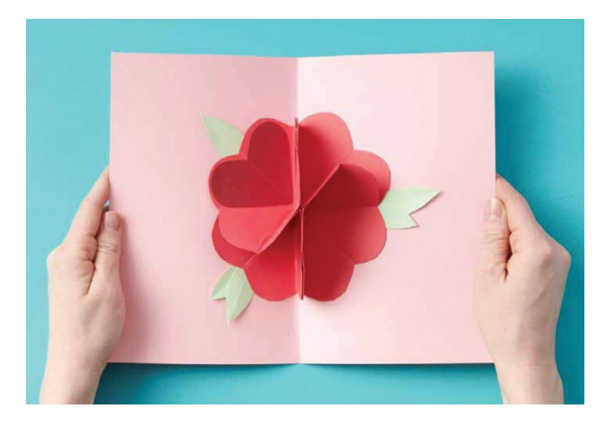
DOWNLOAD instructions for handcrafted pop-up cards at howlifeunfolds.com/lifestyle-interests/pop-cards

Valentine's Day is this weekend, and we're encouraging consumers to celebrate the ones they love by giving them a beautiful paper card and/or a delicious box of chocolates! According to eMarketer, overall spending for the holiday has increased since 2011. In 2019, internet users planned to buy candy (52%) and cards (44%) rather than flowers or clothing. Via our social media channels, we're encouraging consumers to download our instructions for a handcrafted pop-up card or to visit our printables page for even more downloads (we have more than 50 available). With 70,000+ downloads last year, we have more than enough options to celebrate.